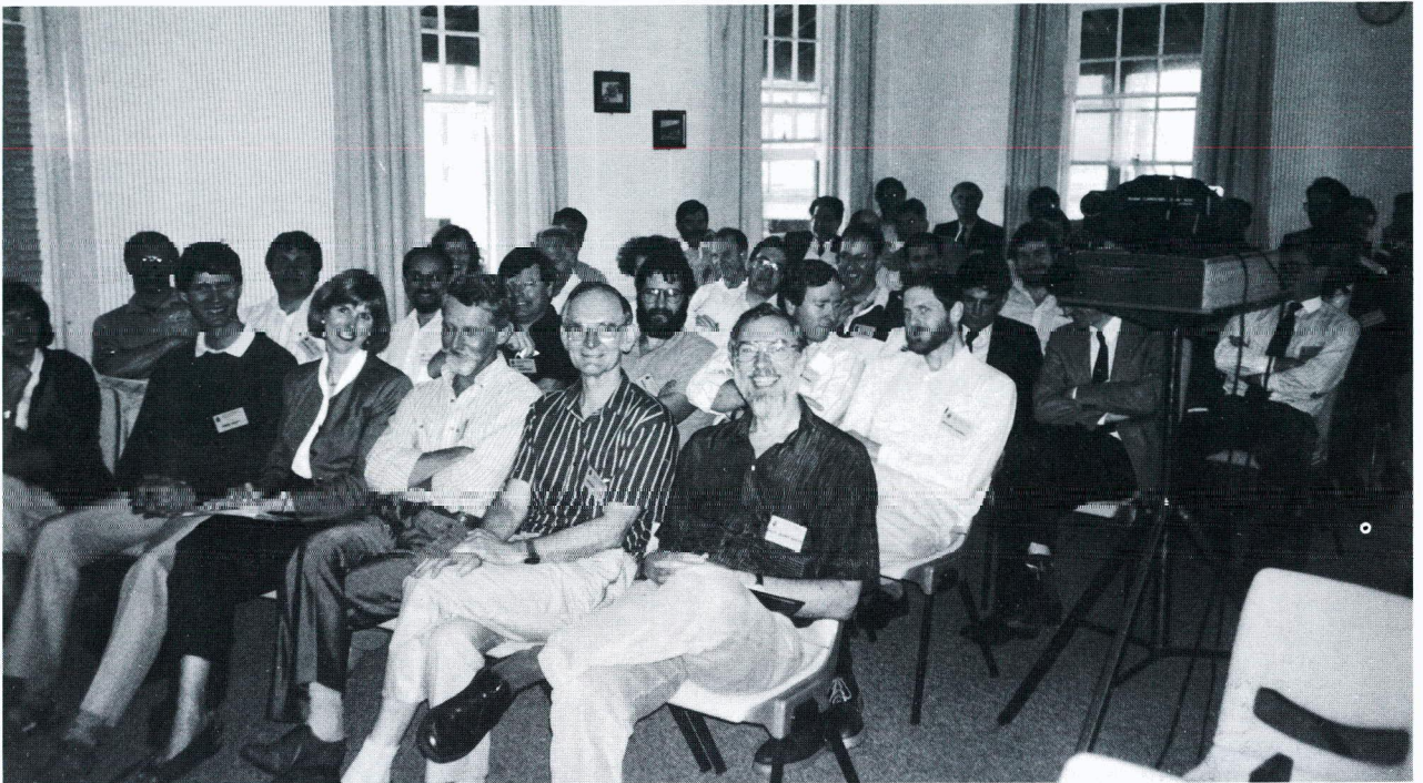
● Registrants at the Cardio Vascular and Thoracic SIG Meeting on Perioperative Myocardial Ischaemia, held at North Head Quarantine Station, Sydney, in November, 1991.