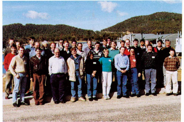
Participants in the 1992 Younger Fellows Course held at Lake Crackenback Resort, near Thredbo.